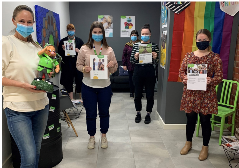
A few members of our team, plus our mascot, Gerome the Gnome!

Headspace Mildura is a one stop shop for young people aged 12-25. At headspace you can access mental health, physical health and sexual health services, work and study support and alcohol and other drug counselling.