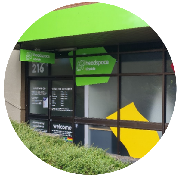
Image description: View of the entrance of the building from the middle of the car park. The building has frosted glass windows and doors with the green headspace Lilydale sign and a yellow shape. Access to the foot path is flat to the right of the photo.

The front door of the building which directly onto the foyer. The entrance is flat and the left hand door can be opened if required.