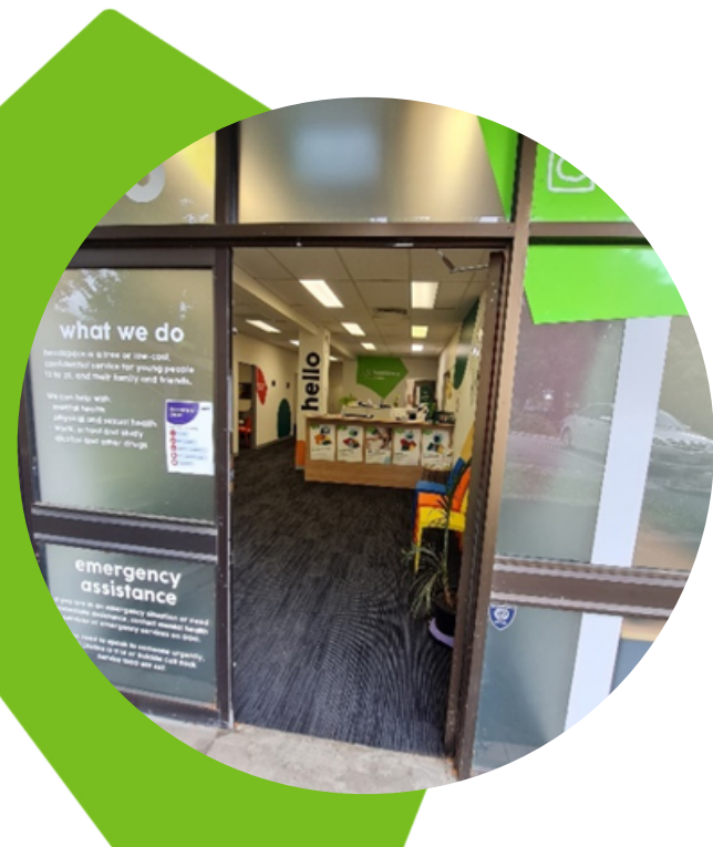
Image description: View of the foyer from the front door. The ground is concrete before changing to carpet when you enter the building, there is a slight lip. The reception desk is immediately in front of the entrance.

The front door of the building which directly onto the foyer. The entrance is flat and the left hand door can be opened if required.