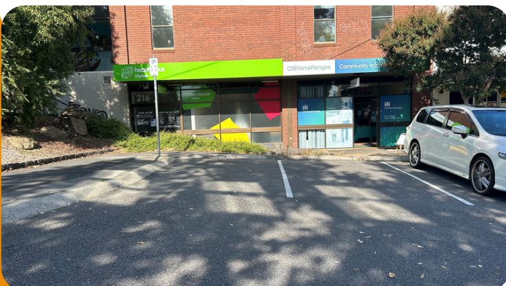
Image description: View of car parking located directly in front of headspace Lilydale entrance. Recommended for Accessibility Parking.

Image description: View of car parking located directly to the right of the headspace Lilydale entrance. There is multiple cars, small hedges and trees and the car park is on a small decline.