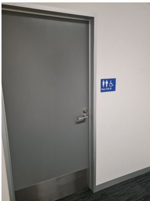
Image description: A grey door with a sign next to it that reads, “Unisex Toilet LH” (including ambulant). There is carpet at the entrance of the door.

One toilet is located at the back of the building past Reception. It is a gender neutral disabled toilet (including ambulant). The doorway of the toilet is 92cm wide and the sink is 82cm off the ground. There is hand railing in here too.