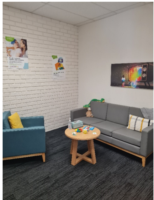
Image description: A consulting room at headpace Lilydale. One grey 3 seater couch and one blue lounge chair with cushions and a throw rug. The coffee table is in between the seating and holds fidget toys and textas. The walls are white with posters located around the room. The room is carpeted.

Image description: The hallway leading past Reception to the consulting rooms. The walls are white with coloured signs indicating room names. Consulting rooms are on the left of the hallway and directly behind Reception.