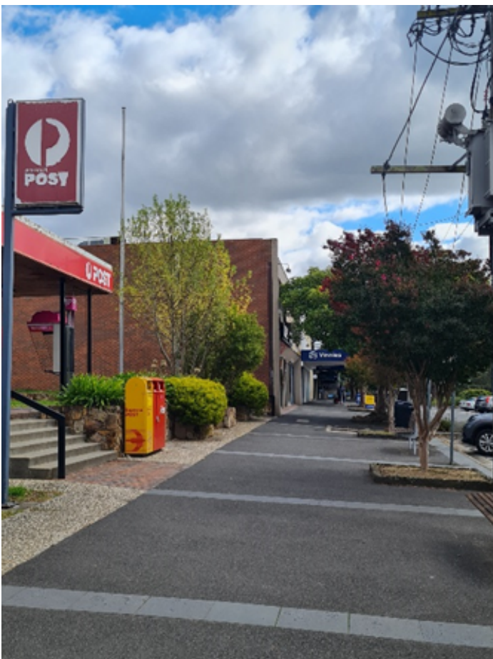
Image description: View of Main Street Lilydale from the back of the Australia Post bus stop heading towards headspace. Australia Post can be seen on the left with 2 post boxes outside it. There are trees to the right.

The Castella Street stop is on the opposite side of the road and you will need to cross Maroonday highway at the pedestrian crossing then continue to headspace down Main Street, crossing over Clarke Street, down the stairs to the entrance of headspace.