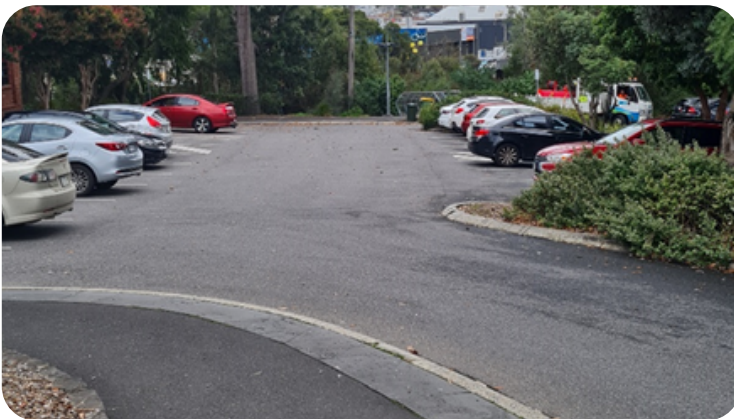
Image description: View of car parking located directly to the right of the headspace Lilydale entrance. There is multiple cars, small hedges and trees and the car park is on a small decline.

There is more street parking on Clarke Street however access to the Centre is then down 17 stairs so we recommend the Main Street Car Park.