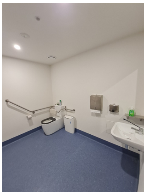
Image description: A toilet with hand rails is in the corner of the room. The floor has blue tiles and the wall is painted white. There is a toilet roll dispenser hung low next to the toilet and a sink opposite the toilet

Image description: A grey door with a sign next to it that reads, “Unisex Toilet LH” (including ambulant). There is carpet at the entrance of the door.