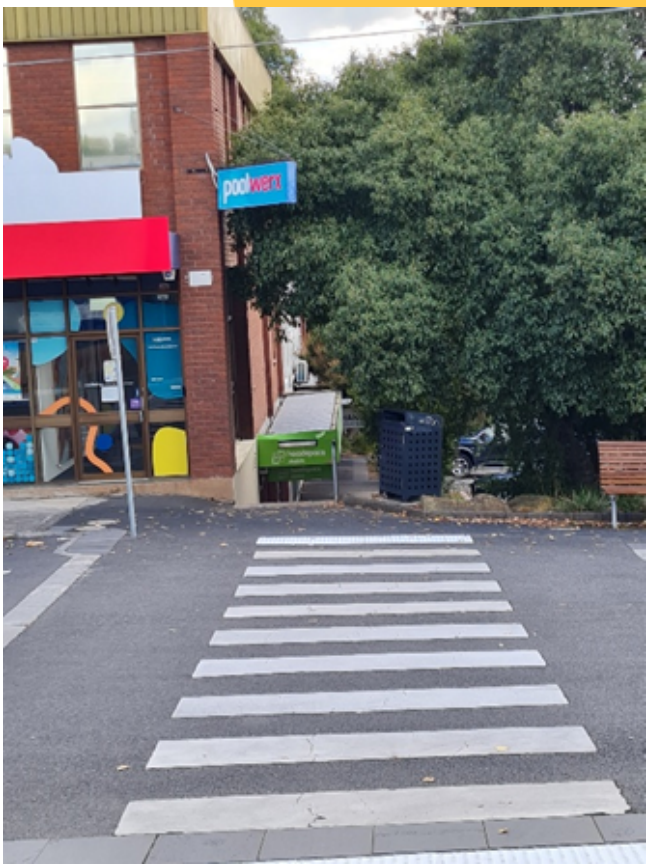
Image description: View of the entrance of the building from before crossing at the pedestrian crossing at Clarke Street. The pedestrian crossing is in the centre, with a bright blue pool works sign on the left over a colourful building. headspace Lilydale can be seen in the distance below some stairs.

From the Lilydale Station bus stop or if you travel by Train, Lilydale Station is approximately 610 meters from headspace Lilydale.