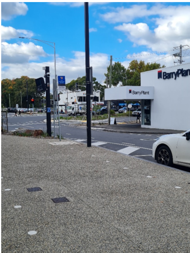
Image description: View of Main Street after exiting Lilydale Station. After crossing William Street East at the pedestrian crossing, you walk up Main Street past the Barry Plant building.

You will need to cross at the Pedestrian crossing at William Street East and head up Main Street on a slight incline. The intersections are often busy with buses, cars and foot traffic.