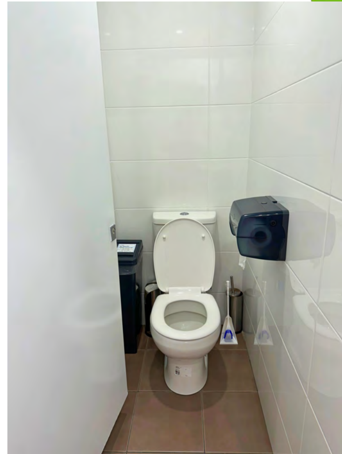
Image description: A cubicle with a white door open. There is a toilet pictured with flush buttons above it. There are two cubicles in the Female toilets.

Image description: Two sinks with soap and a handtowel dispenser. The doors do not have handles.