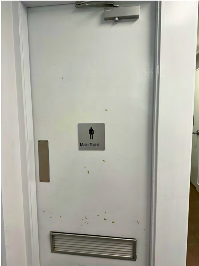
Image description: A white door with a sign that reads 'Male Toilet'. The door can be pushed open.