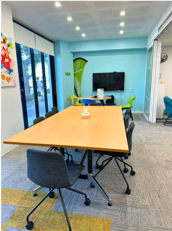
Image description: A long table with 8 chairs, and a small table with four chairs. There is a TV and phone charging station. This room is called 'The Clyde'.