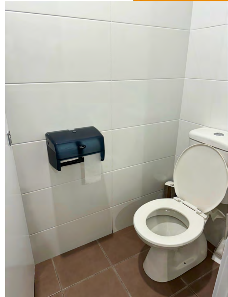
Image description: A cubicle with a white door open. There is a toilet pictured with flush buttons above it. There are two cubicles in the Male toilets.

Image description: A white door with a sign that reads 'Male Toilet'. The door can be pushed open.