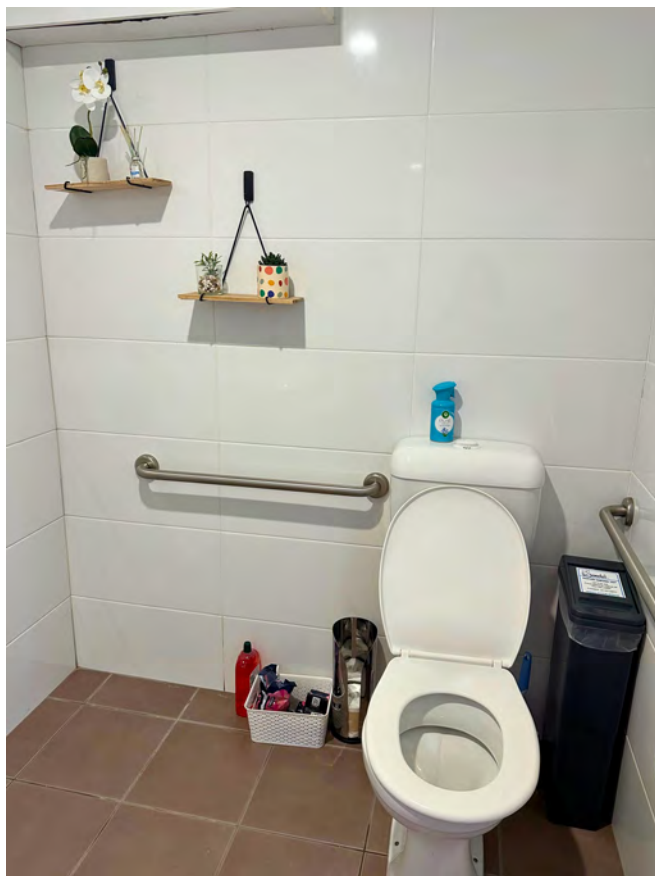
Image description: A toilet with handrails is in the corner of a room. The floor surface is flat and the walls are mostly white tiles. There is a toilet roll dispenser hung low next to the toilet.