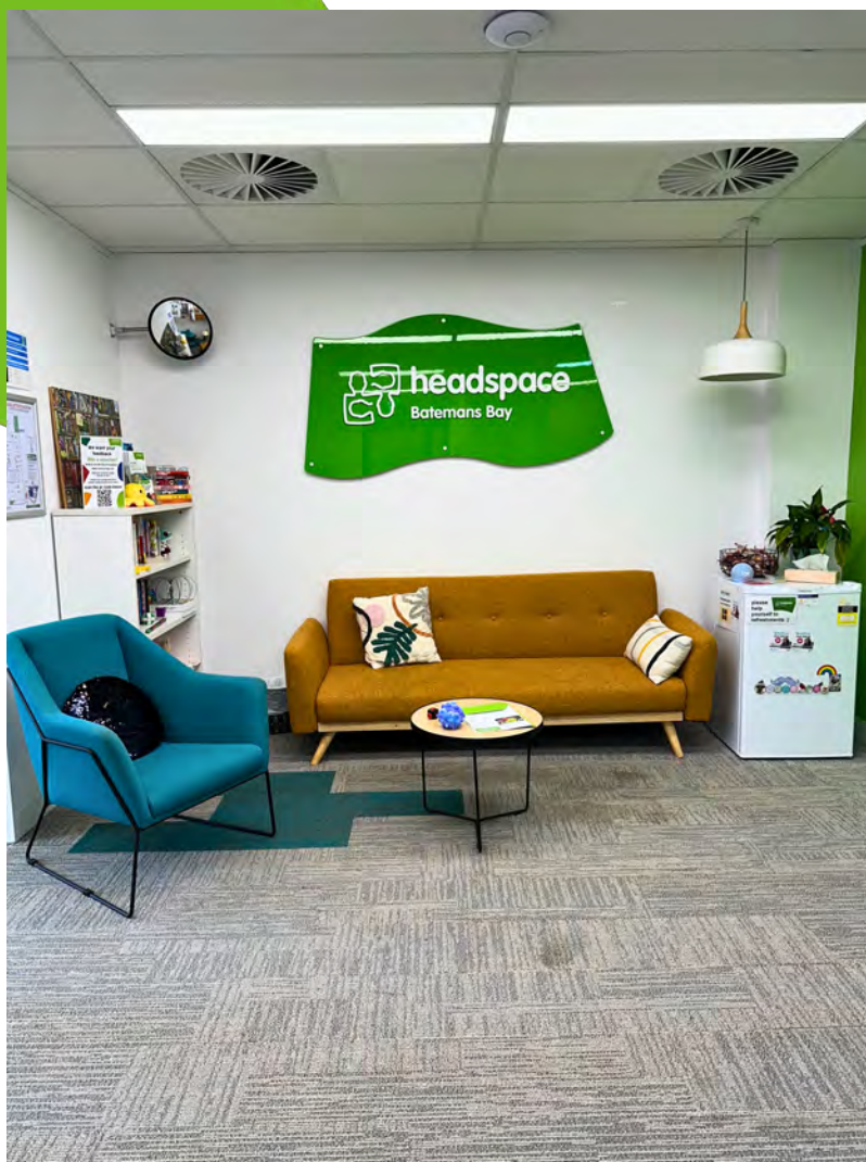
Image description: The reception area at headspace Batemans Bay. There is an orange lounge and a blue chair. There is a fridge with free water and a basket with free snacks. There is a shelf with books, sensory items and games which you can use and borrow from.