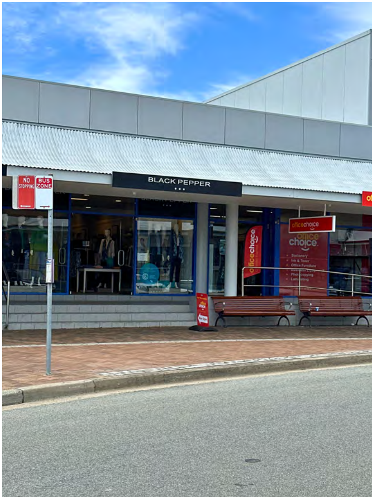
Image description: The bus stop on Orient Street at the Promenade Plaza. It is sheltered, and there are two seats available for you to sit. Signs indicate that this is a bus zone.