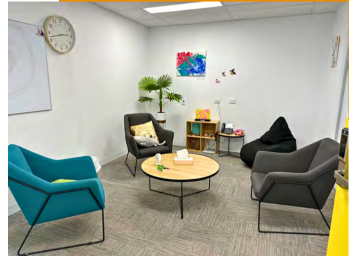
Image description: A room with 3 chairs, 1 black beanbag and a small table. The walls are white with some art and a whiteboard, the carpet is grey.

Image description: A room with 3 chairs, 1 rainbow beanbag and a small table. The walls are painted white with paintings and a whiteboard. The room has grey carpet floors