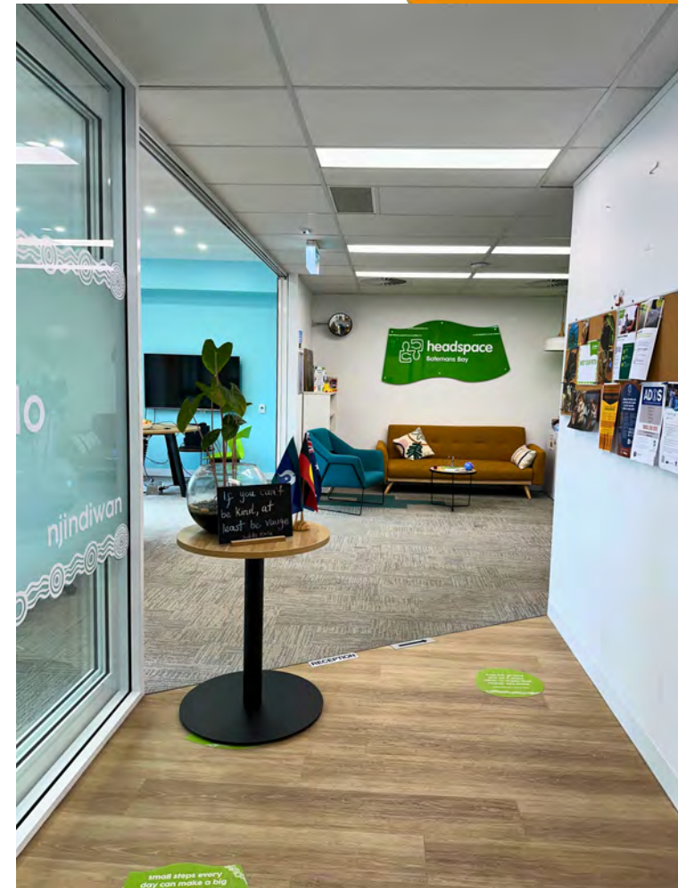
Image description: The entry into our office. This area has a noticeboard, a green sign, and frosted glass announcing 'walawaani njindiwan' which means safe journeys everyone.

Image description: The doorway to headspace Batemans Bay. The door reads 'Welcome' and has a rail beside it. There is a doorbell which can be rung and the ground is even concrete.