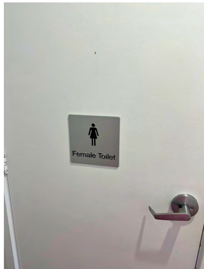
Image description: A white door with a sign that reads 'Female Toilet'. There is a door handle.

Image description: A toilet with handrails is in the corner of a room. The floor surface is flat and the walls are mostly white tiles. There is a toilet roll dispenser hung low next to the toilet.