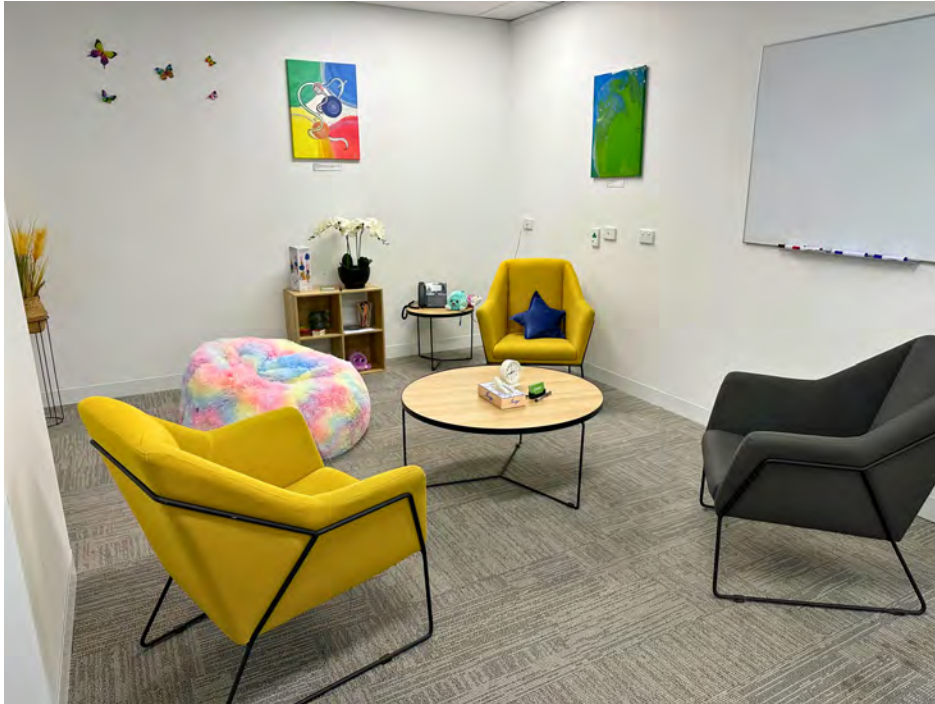
Image description: A room with 3 chairs, 1 rainbow beanbag and a small table. The walls are painted white with paintings and a whiteboard. The room has grey carpet floors

all counselling rooms have sensory items