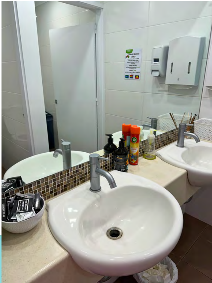
Image description: Two sinks with soap and a handtowel dispenser. The doors do not have handles.