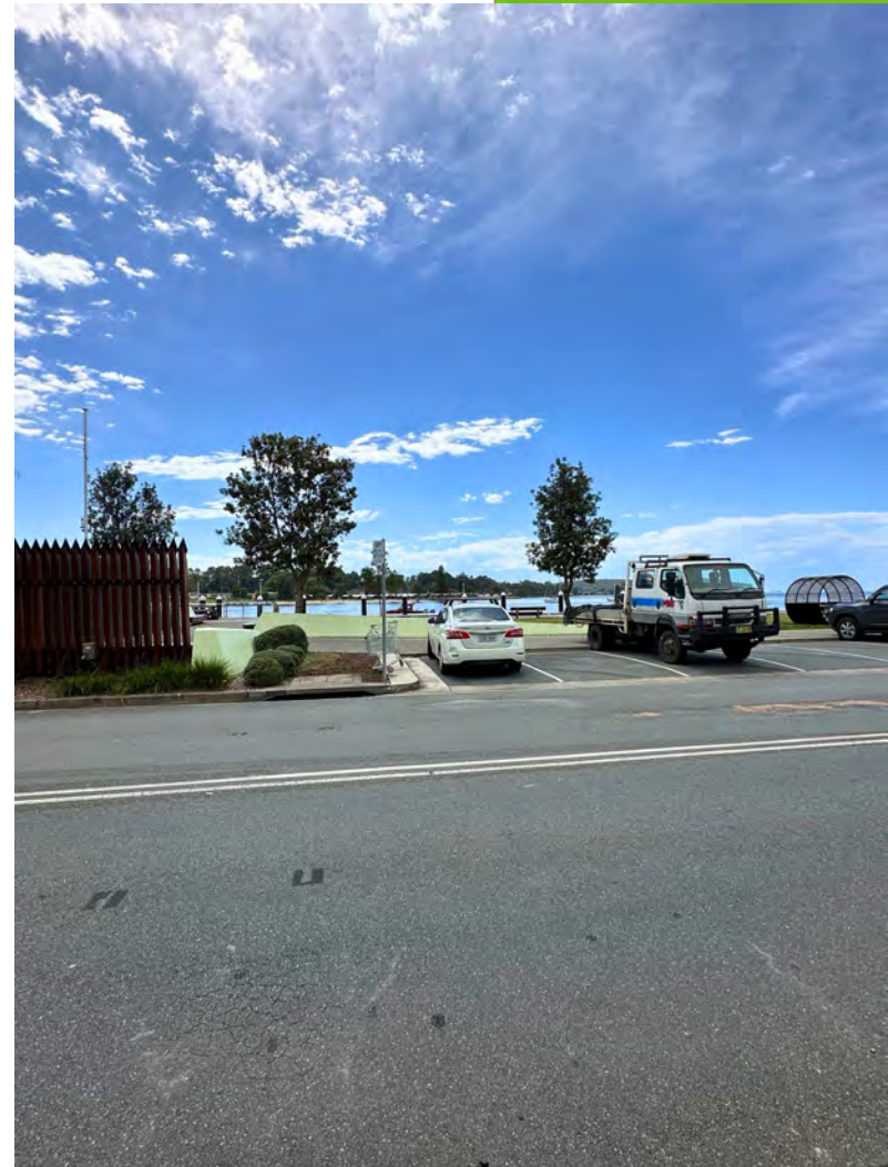
Image description: Parking bays opposite headspace Batemans Bay. There is a sign with information about the parking time limit.

Please note: you may receive a ticket if you exceed the parking time limit.