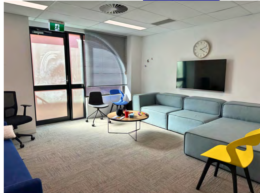
Image description: A room with two lounges, a television, chairs and a small table. The walls are painted white. The carpet is grey. There is a window.