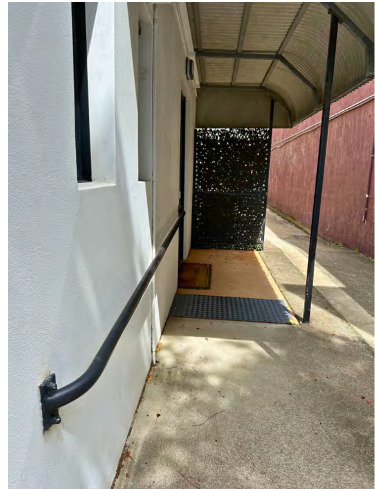
Image description: The entrance to the Batemans Bay centre. There is a rail and doorbell which can be pressed if you require assistance entering the building. There may be leaves and debris if it has been windy.

Image description: The side of the Batemans Bay centre. The building is white and decorated in coloured shapes. There will be a sign out the front during our opening hours to indicate we are open.