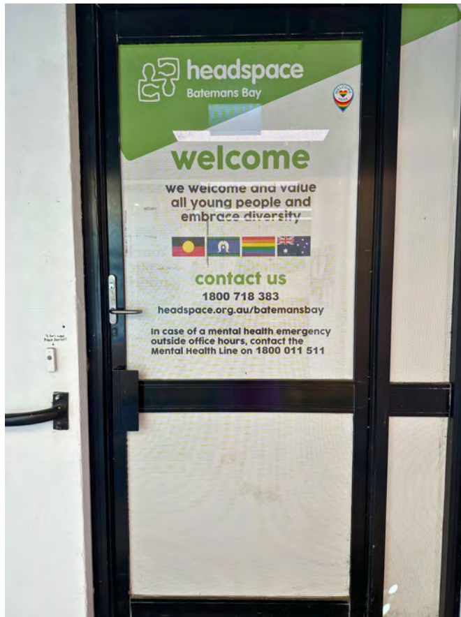
Image description: The doorway to headspace Batemans Bay. The door reads 'Welcome' and has a rail beside it. There is a doorbell which can be rung and the ground is even concrete.