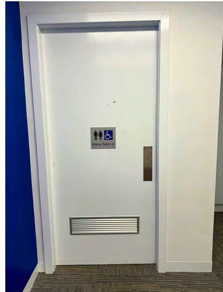
Image description: A white door with a sign that reads, "Unisex Toilet LH". There is carpet at the entrance of the door.

There are 3 toilets in the Mens and Womens toilets and two sinks with soap dispensers outside of the toilets and handtowel. There are also condoms available in the Mens and Womens toilets, and period products available in the Women and Gender Neutral toilets.