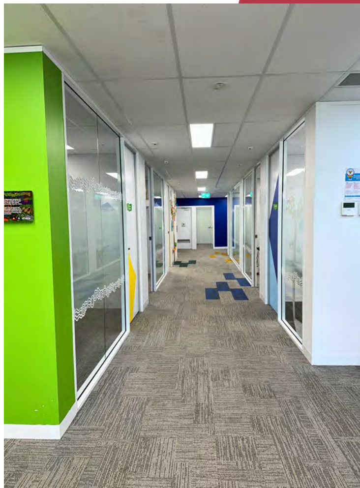
Image description: A hallway with grey carpet floors. The walls are painted light green and white with coloured shapes on the doors.

There are sensory toys in each of the counselling rooms, which you can use during a session.