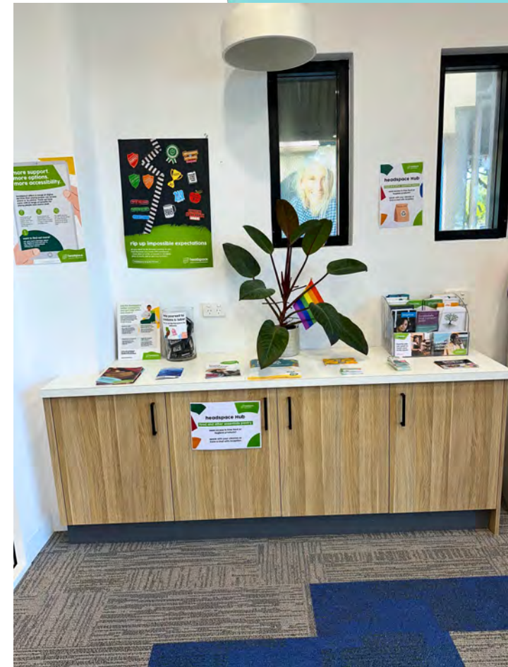
Image description: There is a cupboard with brochures and information. Inside the cupboard is a pantry with free food and hygiene products.

Image description: A long table with 8 chairs, and a small table with four chairs. There is a TV and phone charging station. This room is called 'The Clyde'.