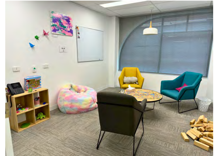
Image description: A room with 3 chairs and a small table. The walls are painted white, with one window and a whiteboard. The carpet is grey.

Image description: A room with 3 chairs, 1 black beanbag and a small table. The walls are white with some art and a whiteboard, the carpet is grey.