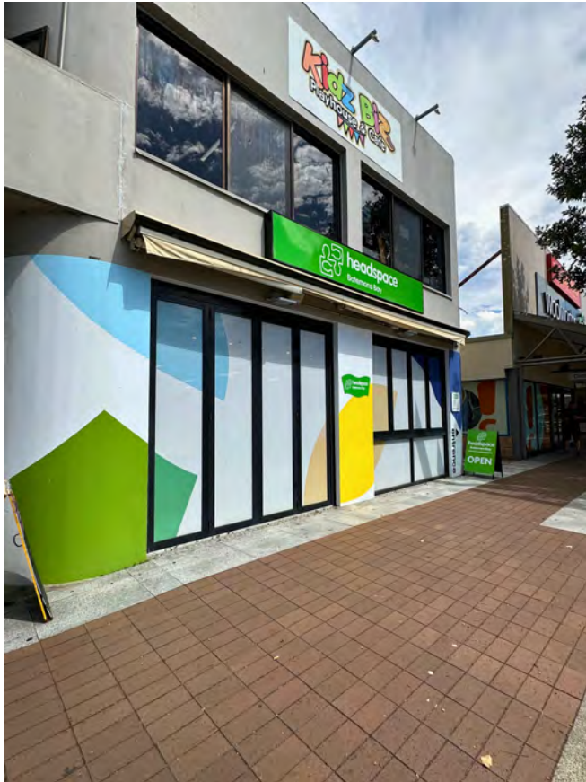
Image description: The side of the Batemans Bay centre. The building is white and decorated in coloured shapes. There will be a sign out the front during our opening hours to indicate we are open.