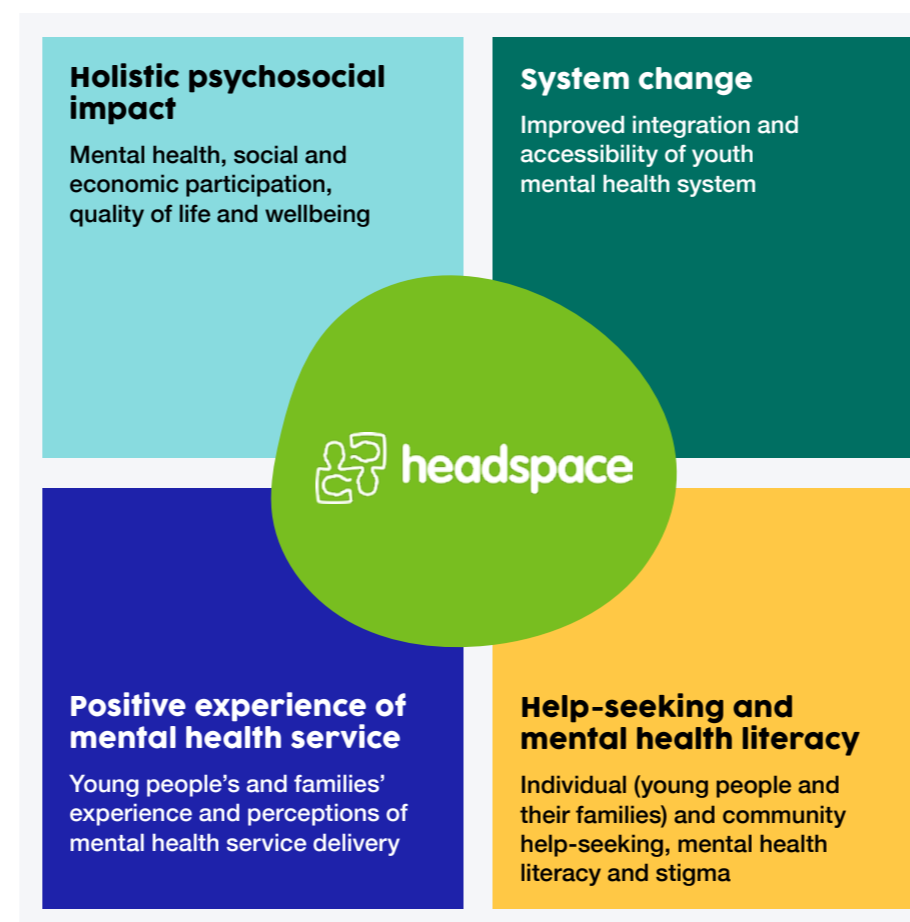
Figure 2: Key outcome areas for headspace centres

four key outcome areas presented in Figure 2 capture the broad range of impacts that headspace centres deliver, alongside the individual-level outcomes of clinical interventions.